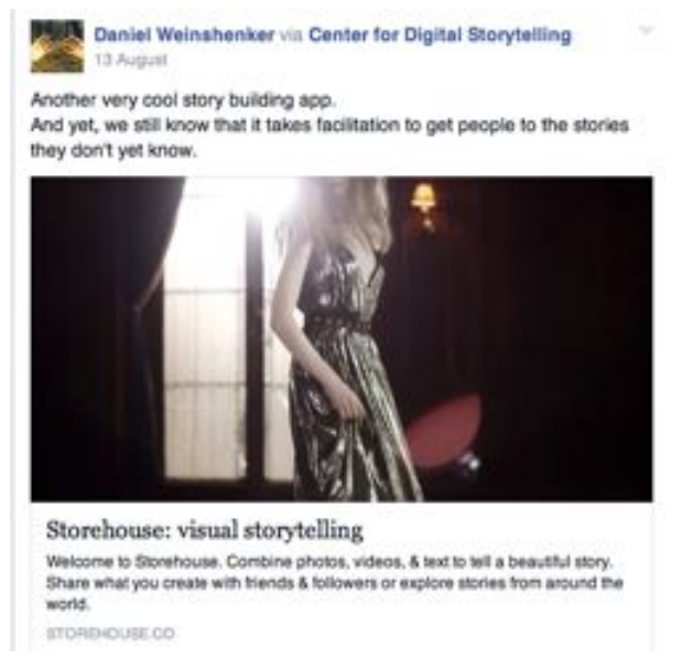
DS Working Group Facebook Notification, 13.4.14

One consideration to take account of in the context of working with older people in Finland, is that many people do have their own laptops, PCs or tablets, so digital exclusion in terms of lack of access to the technology is not as prominent as in other countries. However, one participant, for example, who was over 80 years old, owned a laptop, but did not even know how to open it prior to the digital storytelling workshop. Finding a purpose for utilising the technology is as important as providing access to equipment – more so in this case.