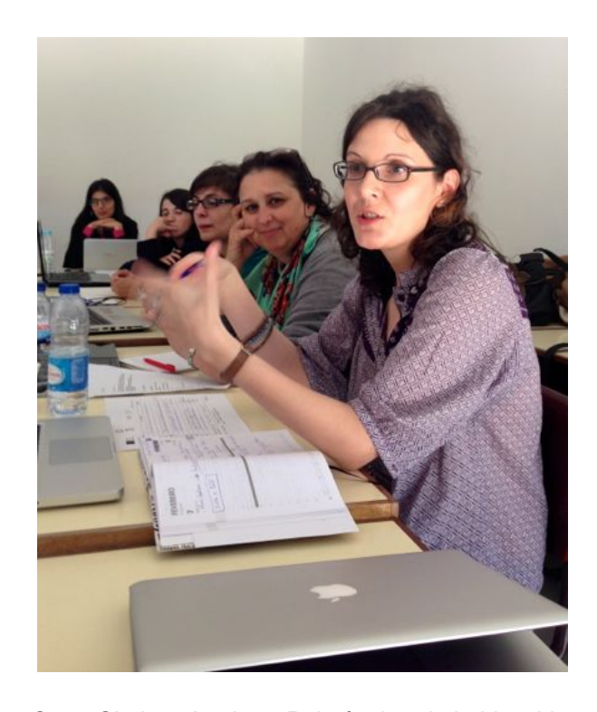
Story Circle at Instituto Polytécnico de Leiria with social work professionals who work with older people, June 2014.

Whilst students use ICT in conventional ways, for research or for presentation of assignments, nursing students do not use computers when they work with older people directly, although social workers do. An example of creative use of ICT has been the documentation of activities with older people (e.g. the preparation of food from their youth) via photographs, which are then presented as a digital film. This is, however, documentation, and not digital storytelling – i.e. the narratives are not stories generated by participants.