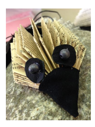
Bookmouse crafts project at Soukka Service Centre (mHealth booster).

Laurea also uses reminiscence and social drama as well as arts, crafts and handicrafts as activities with older people.